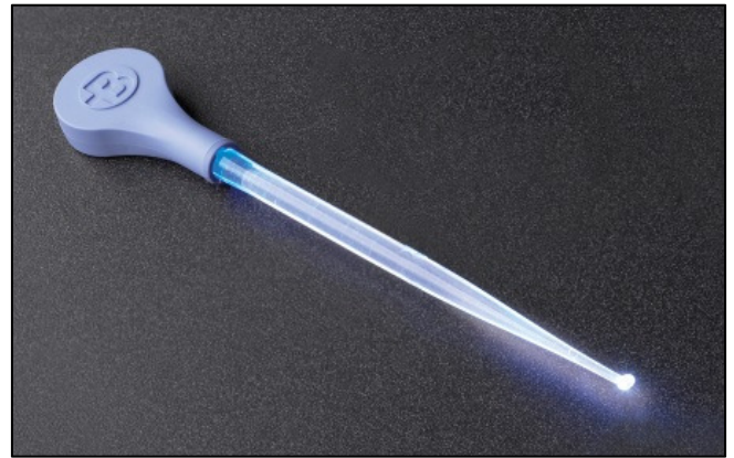
Figure 3: Lighted Ear Curette

TracePro's intuitive design environment, combined with interactive 2D/3D design optimization, visualization and photorealistic rendering capabilities, and award-winning performance and accuracy, helps produce highly successful designs.