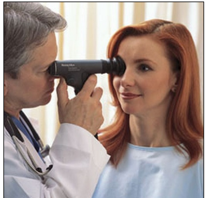
Figure 4: Welch Allyn Panoptic Ophthalmoscope with Half Moon Aperture